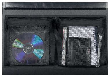
Inner pockets (x2)